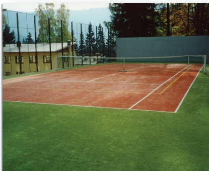
Worn Synthetic Grass